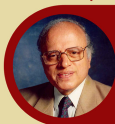
Dr. M S Swaminathan